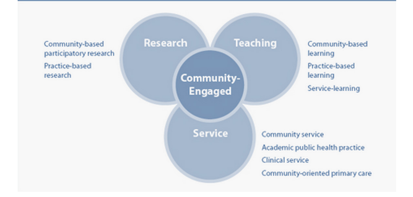
Figure 1 Community-Engaged Teaching, Research, and Service

Linking Scholarship and Communities, Commission Report, 2005